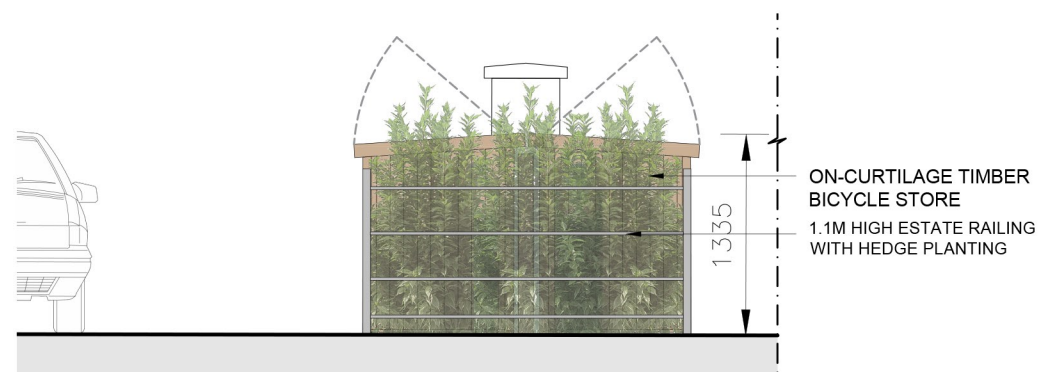
STREET ELEVATION Scale 1:50