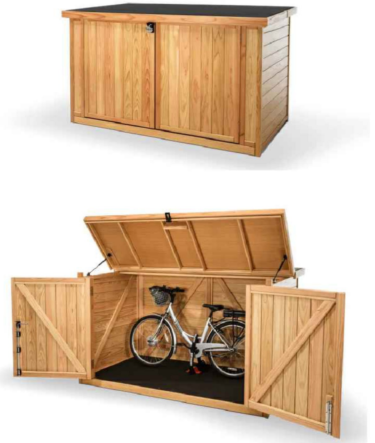
Reference image: Timber Bike Store: Pedalbase or similar.